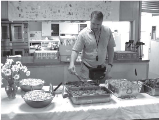
The physical requirements from either processing body are very similar.

practices. The kitchen should never operate without the presence of someone with a current Food Handler's Permit . Additionally, the entrepreneur will need to hold their own license, insurance and food handler's card. This ensures that the congregation will not bear the liability of the entrepreneur's business on their license and insurance.