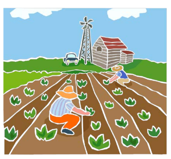
Highlights from the Rockwood Community Food Assessment

Conducted by Ecumenical Ministries of Oregon's Interfaith Food and Farms Partnership in collaboration with We Are Oregon and community Members Funding provided by Presbyterian Hunger Fund, Jackson Foundation and