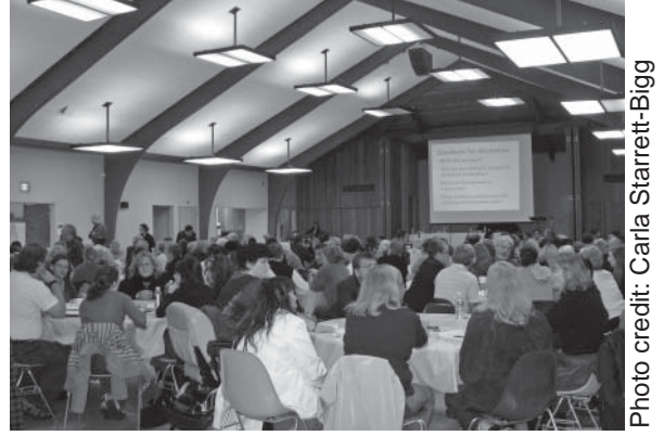
Attendance at the conference on poverty, held in the Collins Hall at First United Methodist Church in Portland, was near capacity.

A second panel expanded the conversation about