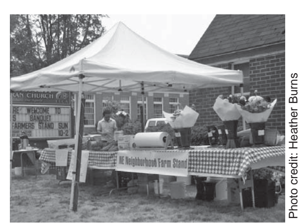
Farm stand at Redeemer Lutheran Church, located at NE Killingsworth and 20th Avenue in Portland.

Copies of the "Everyone Eats" Report and Executive Summary are on the IFFP Web page at www.emoregon.org/food_farms.php.