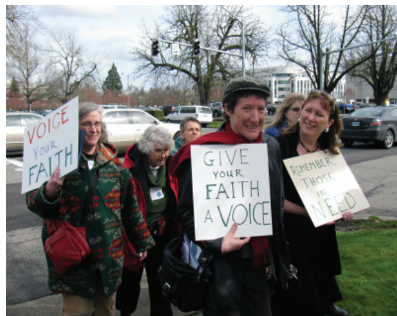
2011 Interfaith Advocacy Day participants marched to the state capitol, standing up for our neighbors in need.

The EMO Public Policy Advocacy is continuing its focus on the state legislature, spending time this summer and fall preparing for the 2012 Session, which is scheduled to run for 35 days starting at the beginning of February.