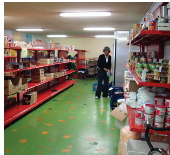
"Stock Our Shelves" is a key component to keep NEFP's shelves stocked with food year-round.

"Stock Our Shelves is a key component to keeping our shelves stocked year round—already ten congregations have signed up for six of the ten months," explains Van Winkle, who has volunteered with NEFP for more than a decade. "We still need to cover January, April, May and June, plus we have room for additional sign-ups in other months."