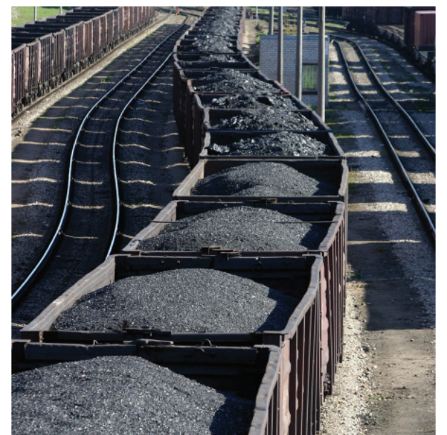
Plans to export coal to Asia’s developing economies would bring open container coal trains and barges from Montana and Wyoming to ports in the Northwest.

1. Washington DEQ is requiring an Environmental Impact Statement (EIS) on Bellingham’s proposed port (Cherry Point). A 60- to 90-day scoping process, which allows for early identification of potentially significant environmental issues, should be underway by mid-September. Since coal trains would head through the Columbia Gorge and southwest Washington, Oregonians can comment; a public meeting will likely be held in Vancouver, Wash.