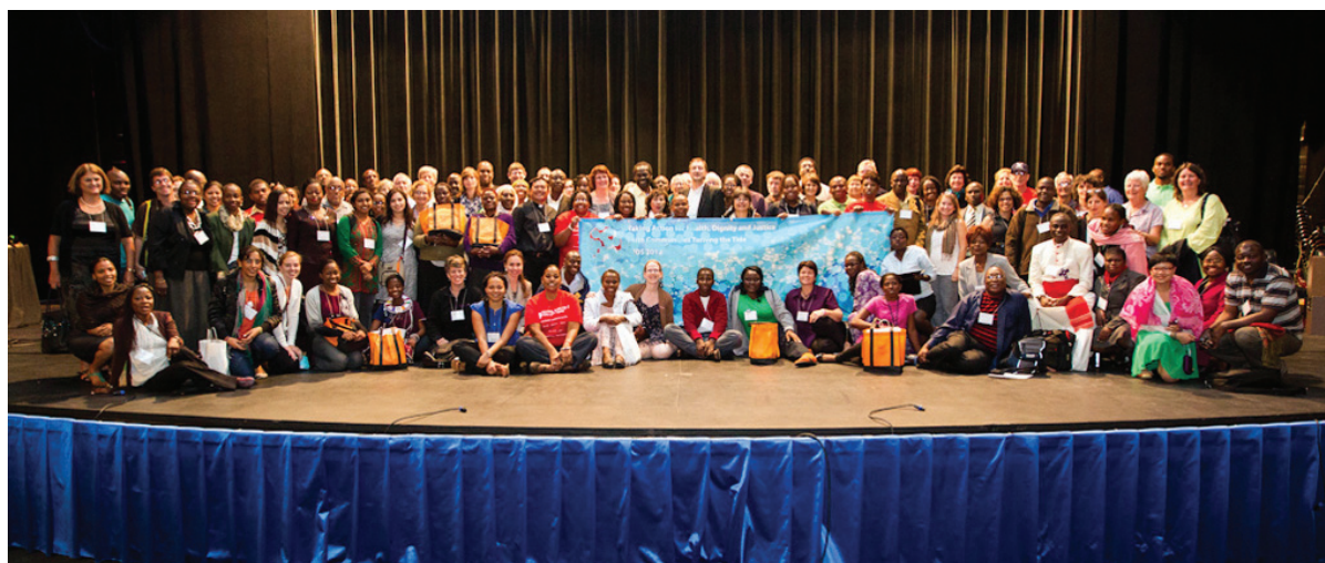
Before the International AIDS Conference began, there was a smaller gathering of leaders and representatives of diverse faith communities from around the world responding to the AIDS crisis in their local communities.

We must affirm the dignity of all individuals, each one created in the image of God, and talk about those things we don't like to talk about in the church. Let us be honest—until we can fully embrace all those living with HIV/AIDS, not just the so-called “easy-to-love,” we will not truly be effective in bringing about an end to HIV/AIDS in our communities.