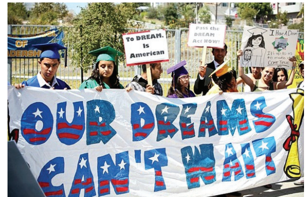
The Immigration Policy Center estimates that approximately 10,400 young people in Oregon are currently eligible to receive a two-year renewable grant of deferred action.