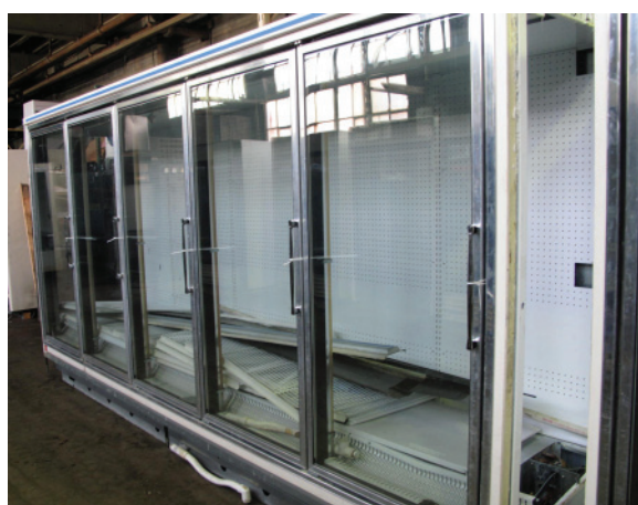
A walk-in cooler will enable the Northeast Emergency Food Program to distribute more perishable food such as fresh produce, dairy products, meat and bread.

Earlier this year, the Swindell Foundation donated $20,000, and the Oregon Food Bank gave $5,000 toward this project. Just last month, the Portland Kiwanis chipped in $750,