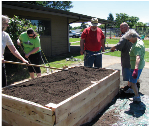
Members of Gresham Bible Church constructed ADA raised beds for the community garden.

The first volunteer group for the project was the Eco-Stewards young adult eco-justice program of Presbyterian agencies. Other youth and young adults helped with the garden, including La Salle High School students, who performed a day of service on various garden needs to kick off the school year. Other young