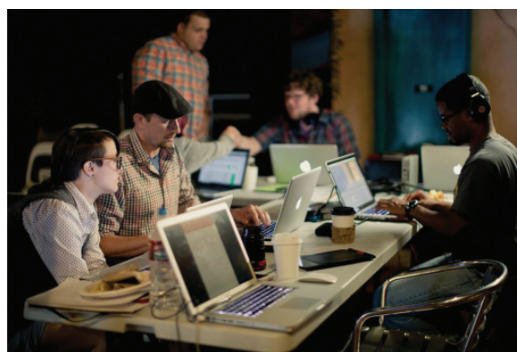
Stillmotion team editing the Second Home documentary.

SOAR Immigration Legal Services offered legal assistance to 709 clients including 18 for Deferred Action for Childhood Arrivals (DACA).