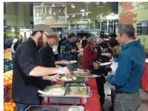
Last year's "Taste of Thanksgiving" at Whole Foods Market Hollywood kicked off NEFP's Give!Guide campaign, and the event raised over $2,000 for the program.

Even if you can't attend one of these tasty events, you can still contribute to NEFP's Give!Guide campaign. We are asking 2,000